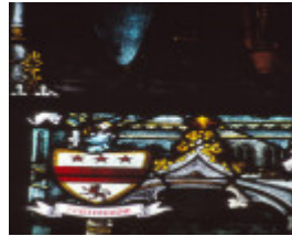
Hawthorn Christ Church St George BR&Co detail 1919