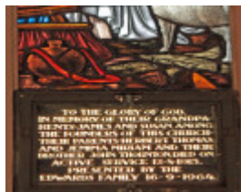
St Arnaud Christ Church Old Cathedral (3)