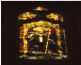
Hawthorn Church of Immac Conception St Patrick 1922