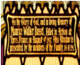
East Laen Bacchus Marsh Basset inscription