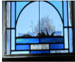
Crib Point HMAS Cerberus Anglican Chapel Sloops (3)