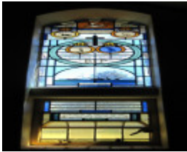
Crib Point HMAS Cerberus Anglican Chapel Sloops (1)