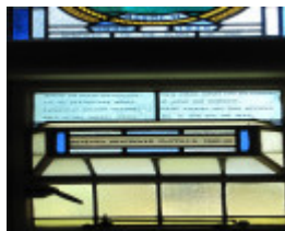
Crib Point HMAS Cerberus Anglican Chapel N Class Destroyers (2)