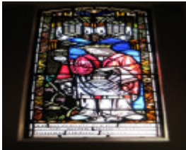
Crib Point HMAS Cerberus Anglican Chapel Feakes (1)