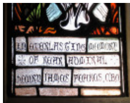
Crib Point HMAS Cerberus Anglican Chapel Feakes (2)