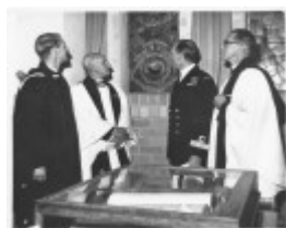
Crib Point HMAS Cerberus Voyager window