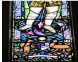
Crib Point HMAS Cerberus Anglican Chapel USN RAN (5)