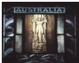
Geelong Grammar School _0002