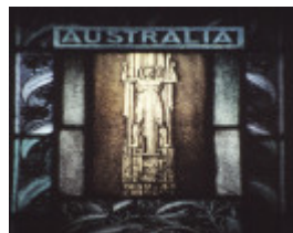
Geelong Grammar School _0002