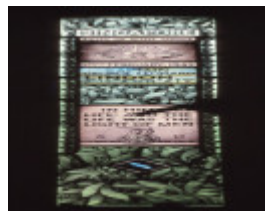
Corio Geelong Grammar School Lindon