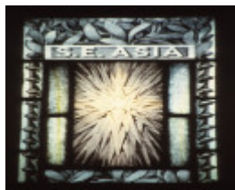
Corio Geelong Grammar College SE Asia_0002