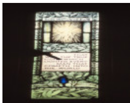
Corio Geelong Grammar College SE Asia_0001