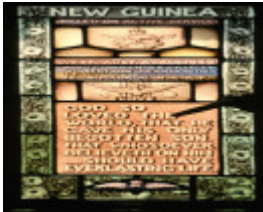
Corio GGS New Guinea Learmonth (1)