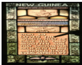
Corio GGS New Guinea Learmonth (1)