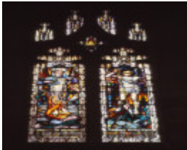
Corio Geelong Grammar School Chapel_ Michael and Uriel