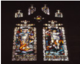
Corio Geelong Grammar School Chapel_ Michael and Uriel