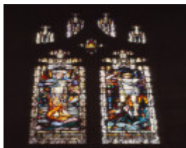
Corio Geelong Grammar School Chapel_ Michael and Uriel