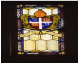
Corio Geelong Grammar School GGS