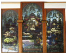
Robinvale St Peter's Anglican Church, formerly at Ultima, Ascension, Brooks, Robinson & Co., 1926