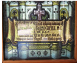
Robinvale St Peter's Anglican Church, formerly at Ultima, Ascension inscription, Brooks, Robinson & Co., 1926