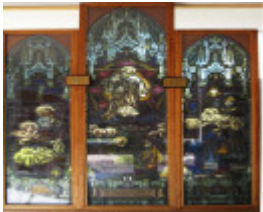
Robinvale St Peter's Anglican Church, formerly at Ultima, Ascension, Brooks, Robinson & Co., 1926