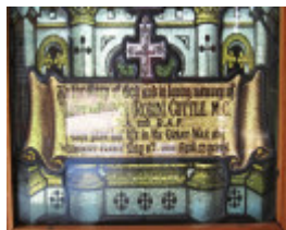
Robinvale St Peter's Anglican Church, formerly at Ultima, Ascension inscription, Brooks, Robinson & Co., 1926