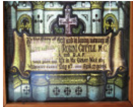
Robinvale St Peter's Anglican Church, formerly at Ultima, Ascension inscription, Brooks, Robinson & Co., 1926