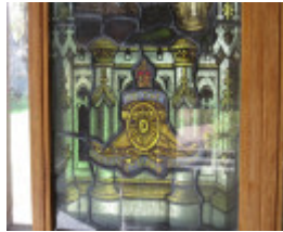
Robinvale St Peter's Anglican Church, formerly at Ultima, Ascension detail of artillery badge, Brooks, Robinson & Co., 1926