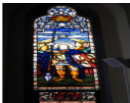
Ararat Holy Trinity Anglican Church, St Michael