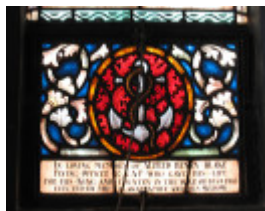
Ararat Holy Trinity Anglican Church, St Michael inscription, Mathieson & Gibson