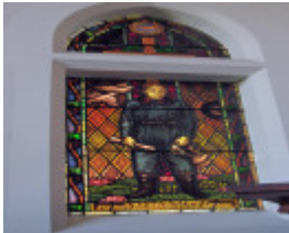
Yarram Holy Trinity Anglican Church