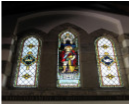
Doncaster Holy Trinity Anglican (2)