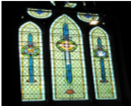
Prahran Independent Church 1928 (1)