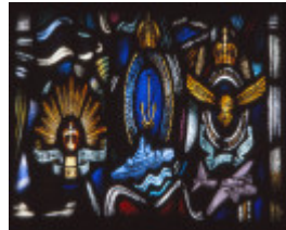
South Yarra Melbourne Boys High School War Memorial 1956_0001