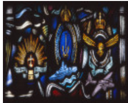
South Yarra Melbourne Boys High School War Memorial 1956_0001