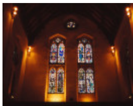
South Yarra Melbourne Grammar Chapel _0001