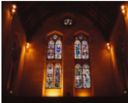
South Yarra Melbourne Grammar Chapel _0001