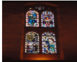
South Yarra Melbourne Grammar Chapel _0003