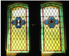
Crib Point HMAS Cerberus Catholic Chapel Scourge Pillar Crown of Thorns