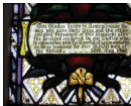
South Melbourne St Paul Uniting Joshua inscription 2