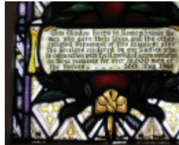
South Melbourne St Paul Uniting Joshua inscription 2