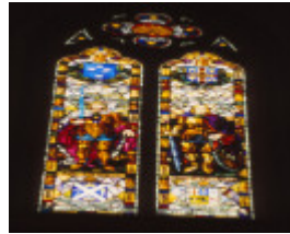
Hawthorn Scotch College Memorial Hall 1930_0002