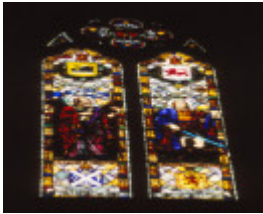
Hawthorn Scotch College Memorial Hall 1930_0004