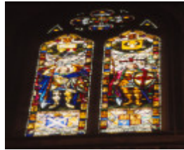
Hawthorn Scotch College Memorial Hall 1930_0003