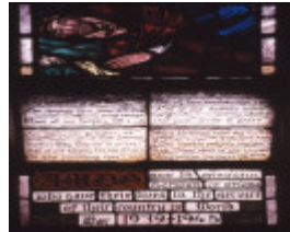
Gardiner St Andrews Uniting Church Jacobs Ladder detail