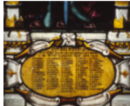
Mentone St Augustines Anglican St Alban inscription