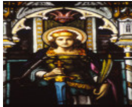
Mentone St Augustines Anglican St Alban BR&Co detail