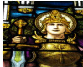
Balwyn St Barnabas Anglican Church, Fortitude detail, Brooks, Robinson & Co.1919