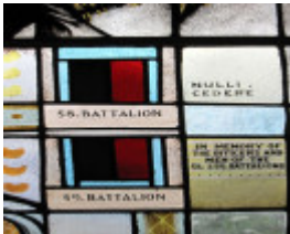
Mordialloc St Brigid's Catholic Church (8)