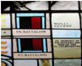
Mordialloc St Brigid's Catholic Church (8)