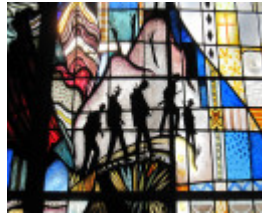
Mordialloc St Brigid's Catholic Church