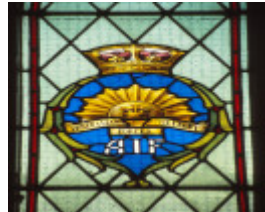
Hawthorn St Columbs Anglican WWII C1950 detail