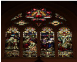
Hawthorn St Columbs Anglican east window WM 1920