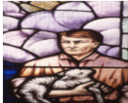
Goornong St Georges Anglican AIF Goldie detail