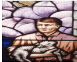
Goornong St Georges Anglican AIF Goldie detail