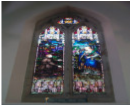
Geelong St Georges Prebyterian 1921