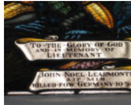
Tyrendarra St James Anglican Church, St. George inscription, Mathieson & Gibson