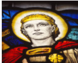
Camberwell St John's Anglican Church, St. Alban detail, Mervyn Napier Waller 1961