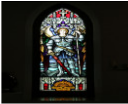
St Helena St Katharines