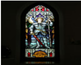
St Helena St Katharines