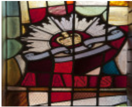
Frankston East St. Lukes 023