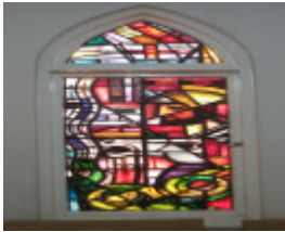
Mildura St Margarets Anglican Church Crump memorial