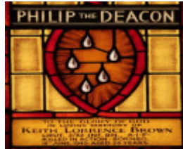
Portland St Stephens Anglican (2)