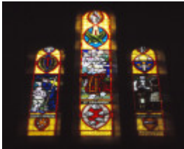
Portland St Stephens Anglican west Baptism