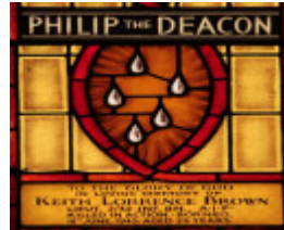
Portland St Stephens Anglican (2)