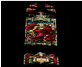
Parkville Trinity College Chapel Jowlett RB