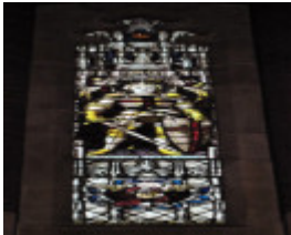
Parkville Trinity College Chapel Grice