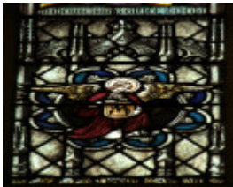
Parkville Trinity College Chapel Grice base RB