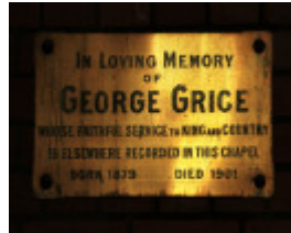
Parkville Trinity College Chapel Grice plaque RB