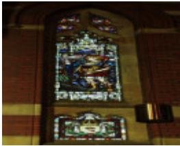
Parkville Trinity College Chapel Moule RB