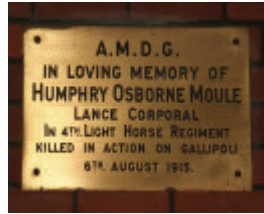
Parkville Trinity College Chapel Moule plaque RB