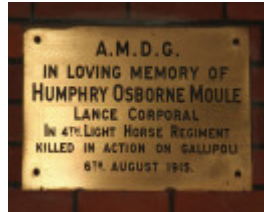
Parkville Trinity College Chapel Moule plaque RB