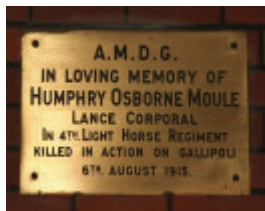
Parkville Trinity College Chapel Moule plaque RB