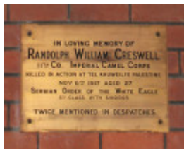
Parkville Trinity College Chapel Cresswell plaque RB