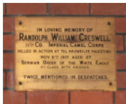
Parkville Trinity College Chapel Cresswell plaque RB