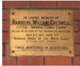
Parkville Trinity College Chapel Cresswell plaque RB