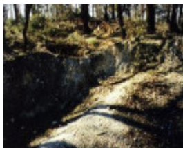
Sandfly Reef Mine and Alluvial Workings