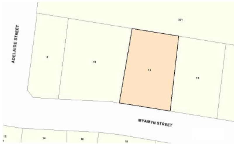
Recommended extent of heritage overlay at 13 Myamyn Street, Armadale.