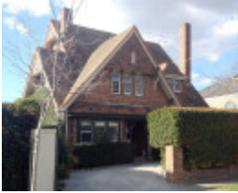
13 Myamyn Street, Armadale