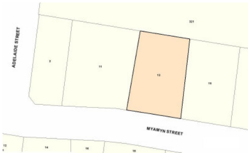
Recommended extent of heritage overlay at 13 Myamyn Street, Armadale.