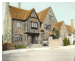
2 Ledbury Court, c1930.