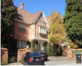
2 Ledbury Court, Toorak