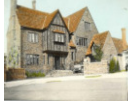
2 Ledbury Court, c1930.