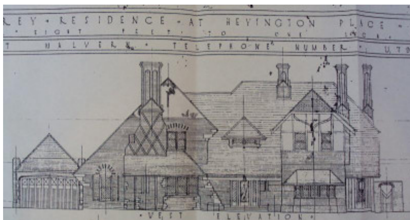
Extract of c1932 drawings by A M McMillan