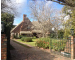
20 Heyington Place, Toorak