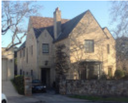
11 Grosvenor Court, Toorak