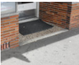
349-355 Keilor Road