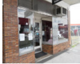
349-355 Keilor Road