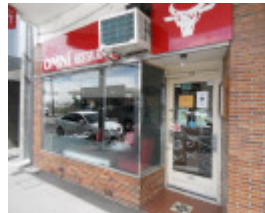
349-355 Keilor Road