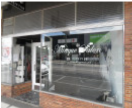
349-355 Keilor Road