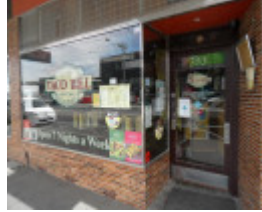
349-355 Keilor Road