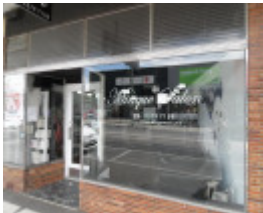
349-355 Keilor Road