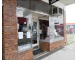
349-355 Keilor Road