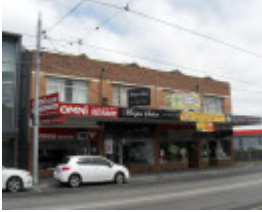
349-355 Keilor Road