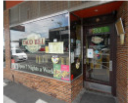
349-355 Keilor Road