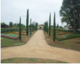
WHITE HILLS BOTANIC GARDENS SOHE 2008