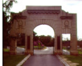
1 white hills botanic gardens arch