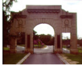
1 white hills botanic gardens arch