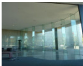
Main Spring Street foyer