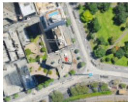
Aerial view of Shell House