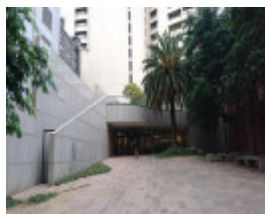
North facade of Shell House from Flinders Lane