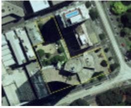
Aerial view of Shell House