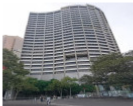
1 SPRING STREET