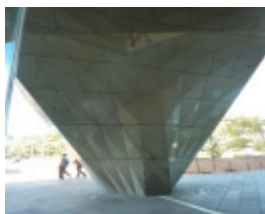
Building pier in main external plaza