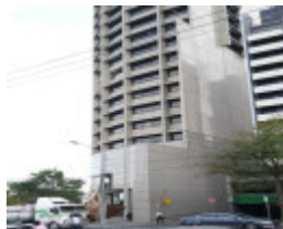
Views showing interfaces with adjacent Spring St building and Flinders St building