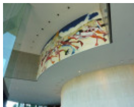
Mural by Arthur Boyd in main Spring Street foyer