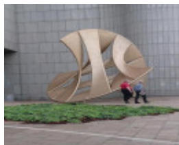
?Shell Mace? sculpture in main external plaza