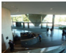
Main Spring Street foyer from escalator