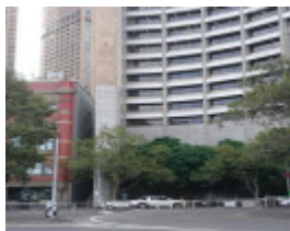
Views showing interfaces with adjacent Spring St building and Flinders St building