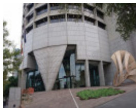
Main external plaza at corner of Spring and Flinders Streets