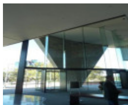
External plaza from main Spring Street foyer